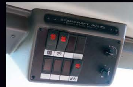
Driver's switch panel conveniently located within view of the road and not on the engine cover