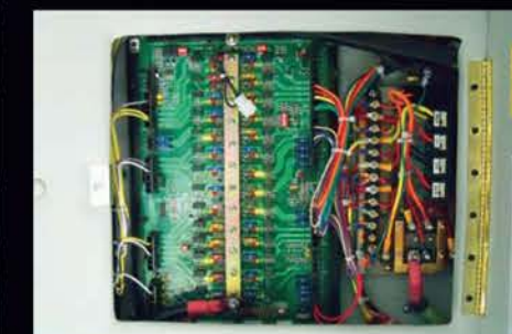
Printed electrical circuit board with LED trouble-shooting lights