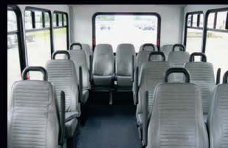
Optional 13 passenger capacity with mid back seats, top seat mounted grab handles and armrests. Also shown, complete FRP interior for long lasting durability.