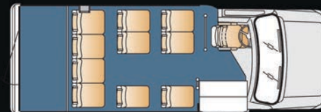
10 Passenger Plus Driver with Secure Rear Cargo Area