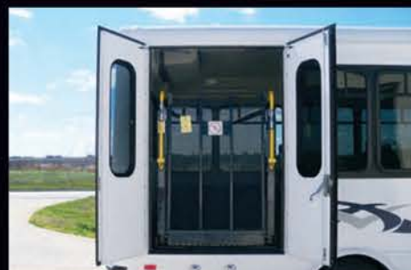
Optional double wheelchair door with top mounted gas shocks to hold door open in windy conditions