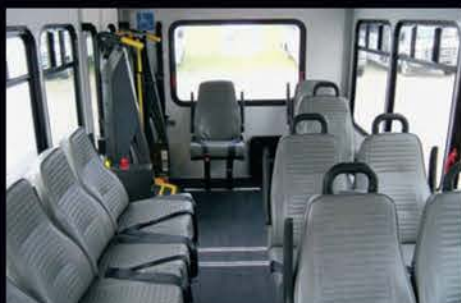
Optional wheelchair accessible floor plan with mid back seats, top mounted grab handles and armrests. Also shown, complete FRP interior for ease of cleaning.