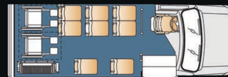
Lift System for Wheelchair Passengers, Plus 8 Ambulatory Passengers