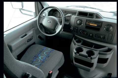
Comfortable and easily-accessible driver's area