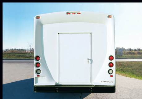
Stylish fiberglass rear cap with rear luggage access door