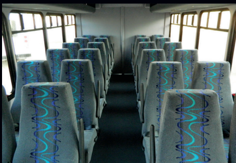
Spacious interior with high-back seats and overhead luggage racks