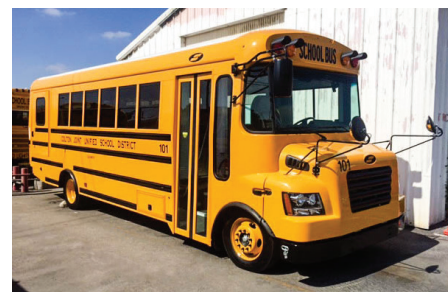
MOTIV-POWERED TYPE C SCHOOL BUS